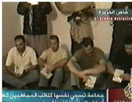
The four hostages were working in Iraq as private security guards.

The killing united Italy -- at least temporarily -- where the majority of the population overwhelmingly opposed the center-right government's support for the U.S.-led war in Iraq.